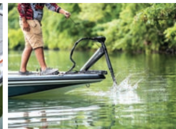
Minn Kota® Edge® 12V, 55-lb. (24.95 kg) thrust, 45" (1.14 m) shaft foot-control trolling motor