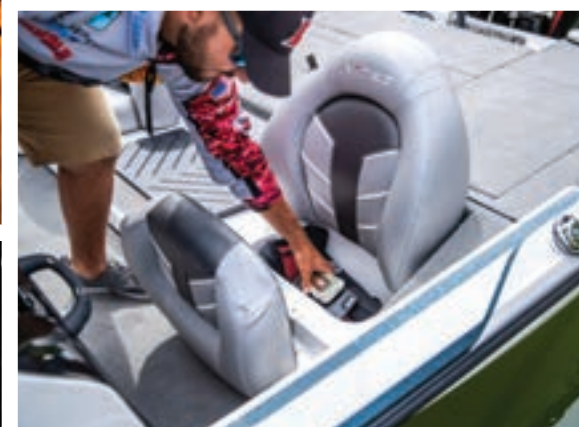
Driver & passenger bucket seats w/molded-in, gelcoated storage below each

Boats may be shown with optional equipment and accessories. Complete motor, feature and specification information available starting on page 52.