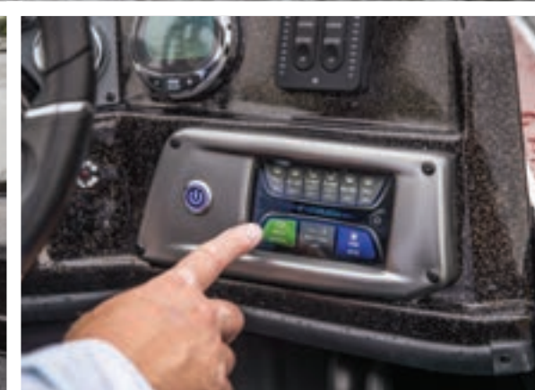
NEW touchscreen switch panel w/1-touch boat controls including First Fish, Nite Mode, master power, trim, lighting, bilge, livewells & more