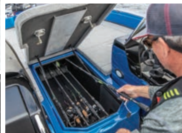
3-level center rod locker w/organizers for rods up to 8' (2.44 m) plus passenger rod ramp