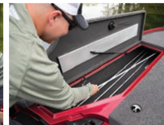
Oversized, lockable bow port & starboard rod lockers w/lift assists for rods up to 8" (2.44 m)