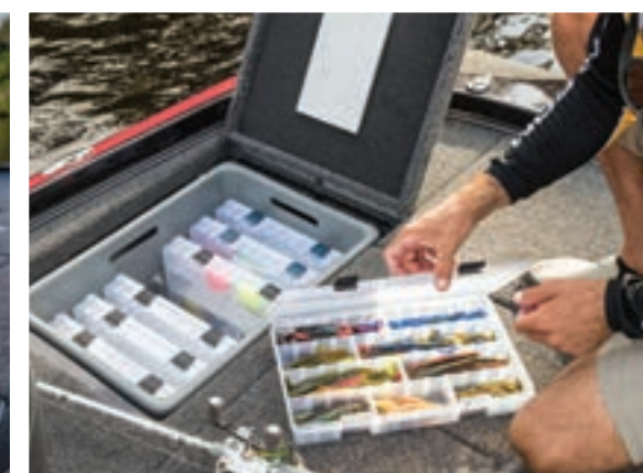
Massive, lockable center bow tackle storage w/molded-in rain/spray channels, dual piston lift assist, LED lighting & optional magnetic under-lid lure organizer