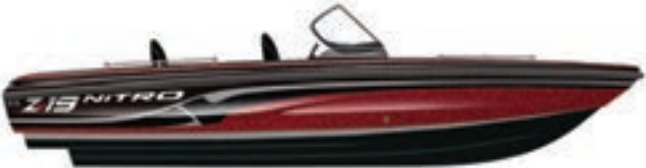
COLOR NO. ZVEL130