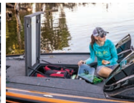
Oversized lockable bow center storage locker w/piston-lift assist