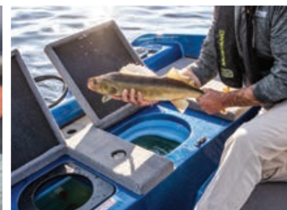
26-gal. (98.42 L) aft NITRO®-exclusive GUARDIAN™ livewell & 5.5-gal. (20.82 L) bow baitwell w/bucket