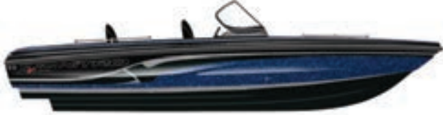
COLOR NO. ZVEL131