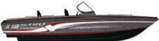
COLOR NO. ZVEL101