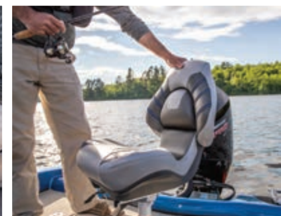
NEW Attwood® Centric X driver, passenger, fishing & bike seats w/shock-dampening core