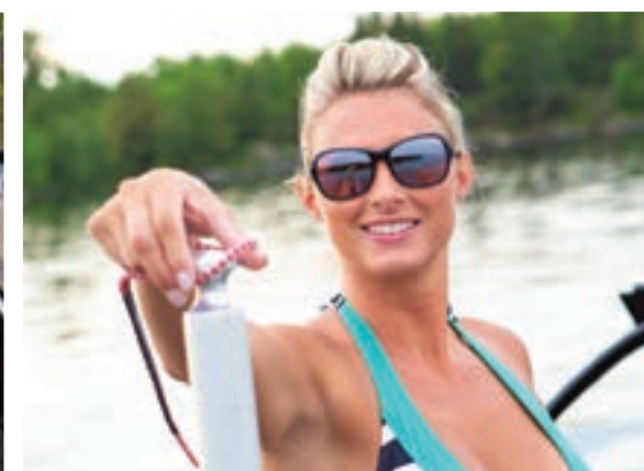
Stowable ski tow pylon & 2 jump seats in aft deck