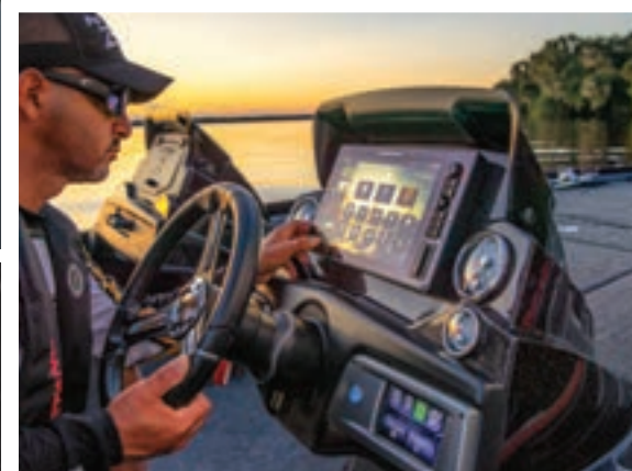
NEW modular, aerodynamic console design w/expanded leg clearance & larger graph surface

Boats may be shown with optional equipment and accessories. Complete motor, feature and specification information available starting on page 44.