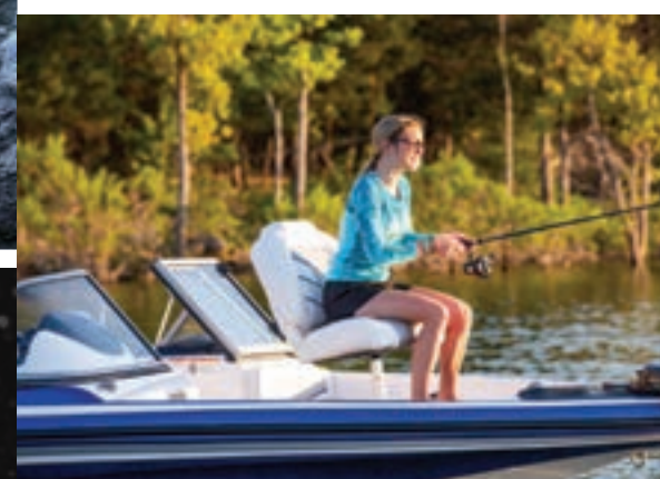
2 convertible & removable fishing seats

Boats may be shown with optional equipment and accessories. Complete motor, feature and specification information available starting on page 53.