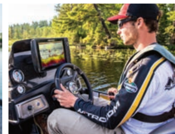
NEW modular, aerodynamic console design w/more leg clearance & larger fishfinder surface