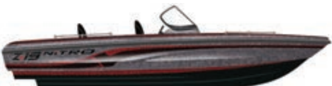
COLOR NO. ZVPR101