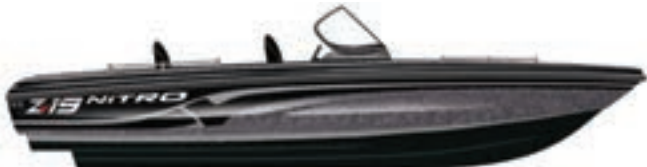
COLOR NO. ZVEL109