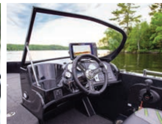
Port & starboard consoles w/2-tone gelcoat scheme (optional walk-thru windshield shown)