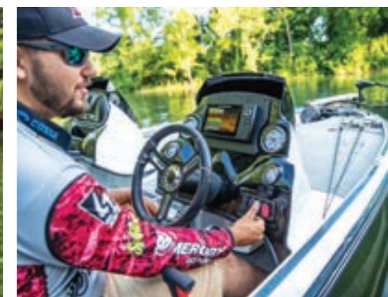
Custom-molded modular console w/2-tone gelcoat w/Lowrance® HOOK2 4x fishfinder