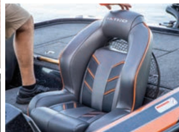
Z-CORE™ seating system w/Force Flex suspension & contoured, rotomolded frame for driver & passenger

Boats may be shown with optional equipment and accessories. Complete motor, feature and specification information available starting on page 48.