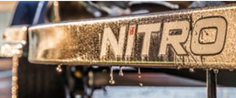
GALVASHIELD Impact powder-coat finish for improved corrosion & chip protection

Other features include radial tires, an outboard motor support, safety winch strap on the heavy-duty winch, swing-away tongue, low-maintenance hubs, safety cables, pivoting tongue jack and more. So, when you're ready to leave home and head to the water, your NITRO boat package is too!