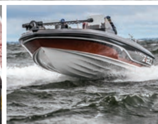
Deep V NVT™ performance hull w/RAPID PLANING SYSTEM™ (RPS™) transom