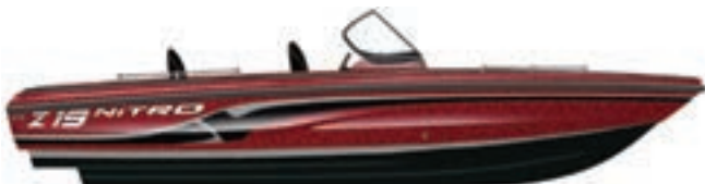
COLOR NO. ZVPR100