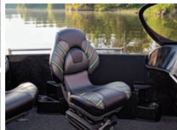
NEW Attwood® Centric X driver & passenger seats