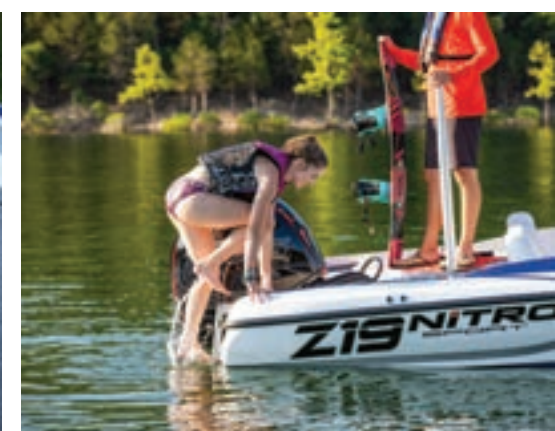
Aft swim platforms w/starboard boarding ladder & removable ski tow pylon