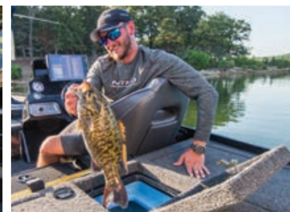
2 NITRO-exclusive 19-gal. (71.92 L) aerated, recirculated GUARDIAN™ livewells w/pump-outs