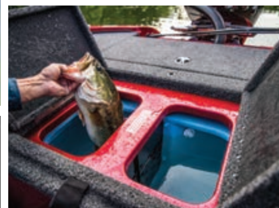
2 aft 19-gal. (71.92 L) insulated, aerated GUARDIAN™ livewells w/digital timers & baffled rim for reduced slosh

Boats may be shown with optional equipment and accessories. Complete motor, feature and specification information available starting on page 50.