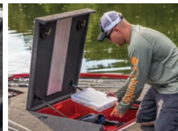
Oversized lockable bow center storage locker w/piston-assist lid