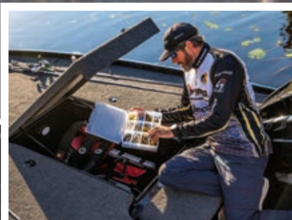
Oversized lockable bow center storage locker w/TACKLE MANAGEMENT SYSTEM™ & piston-assist lift

Boats may be shown with optional equipment and accessories. Complete motor, feature and specification information available starting on page 46.