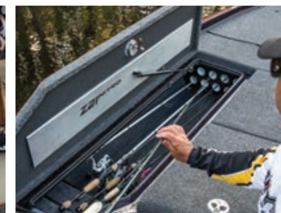
Oversized, lockable bow port & starboard rod lockers w/lift assists for rods up to 8' (2.44 m)