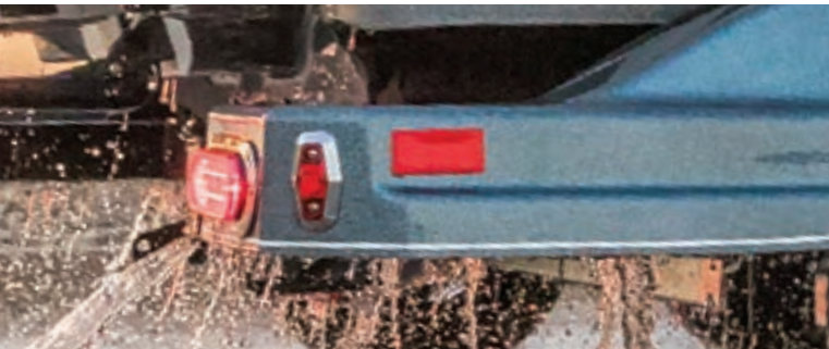
Submersible, angled LED backup lights for long life & improved visibility