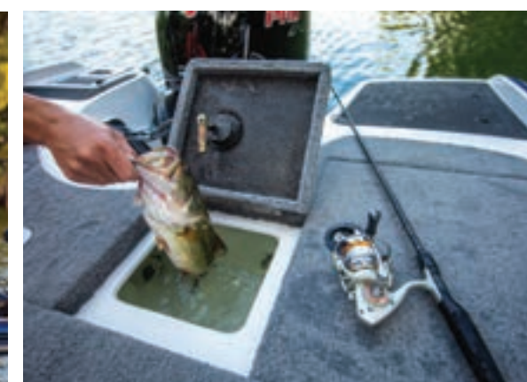
Aft 16-gal. (60.57 L) rotomolded & aerated livewell w/timer, pump-out system & rounded corners