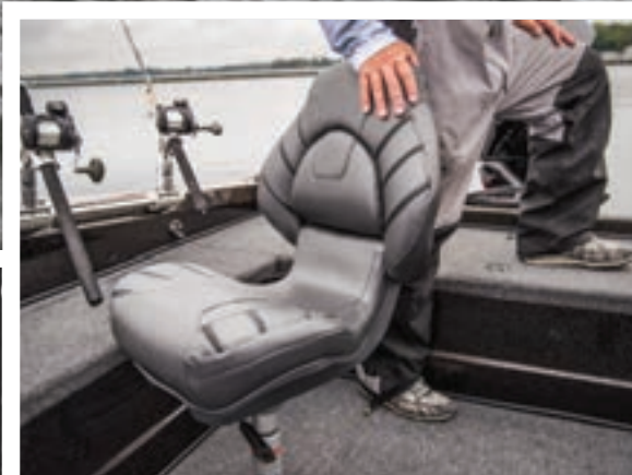
Attwood® Centric X folding molded fishing seat w/hydraulic pedestal

Boats may be shown with optional equipment and accessories. Complete motor, feature and specification information available starting on page 56.