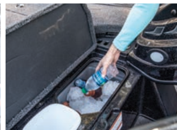
Step to bow deck w/62-qt. (58.67 L) insulated cooler & removable trash receptacle